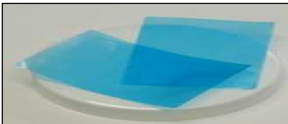
Figure No.2: Fast Dissolving Film